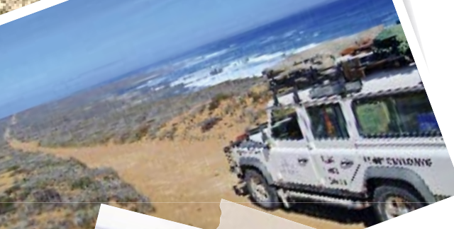
Elephant at sunset in Chobe NP (top); on the way to market in Namibia (centre); coastal trail through diamond leases - South Africa's west coast (above)

W e're currently sitting in Cape Town watching the sun come up over the mountains and splash some colour onto Table Mountain, the surrounding city and its harbour. Wow - it is a beautiful city... and I don't normally like these sorts of places!