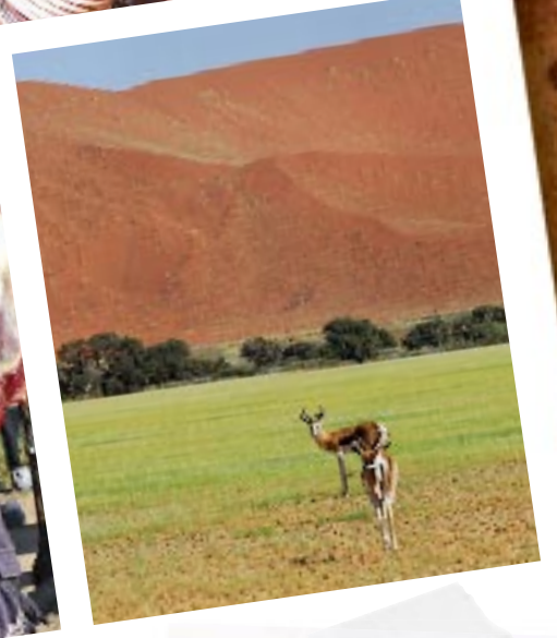
Himba woman and child (top); springbok, rare green grass and big dunes - Sossuslvie (above); local butcher (above left); Steve and black Rhino rescued after being badly injured while fighting (below)